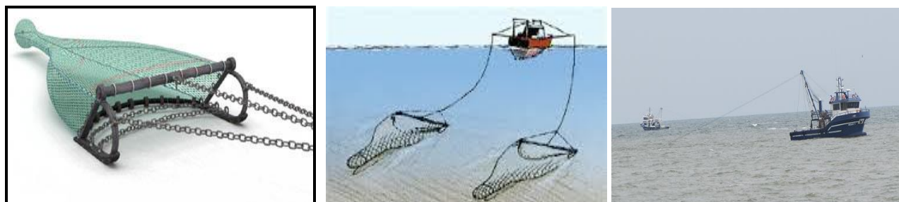
Beam trawl fishing gear

The method used was that of area investigation using the beam trawl for the sampling procedure. The beam trawl is a towed filtering gear in terms of construction and consists of a beam (metal pipe) supported at its ends by two metal skids and the net (collection bag consisting of cap, base and side). The traverse and feet are the backbone frame that attaches the net, which in turn is fixed to the front of the foot on a frame of resistance (rope, cable or chain), which aims to engage and direct to the concentration zone of the bag the target species ( R. venosa ).