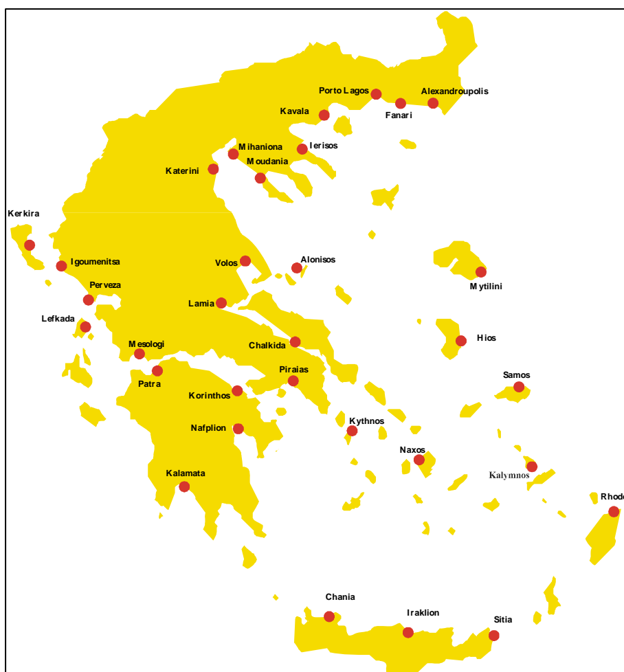
Figure 2.1.1. Sampling Sites

Local correspondents will be responsible for collecting data on fuel consumption and fishing effort for each vessel category and type of technique in each site on a monthly basis, as defined in Annexes III and VIII of the Regulation. The sampling density required in order to meet the above-mentioned precision levels per vessel category and fishing technique is presented in Table 2.1.