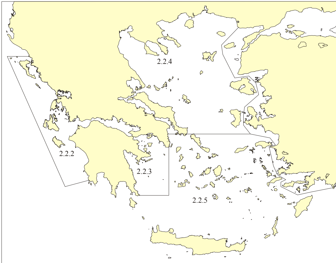
Figure 5.1. Map of biological sampling areas with experimental fisheries in the Greek seas