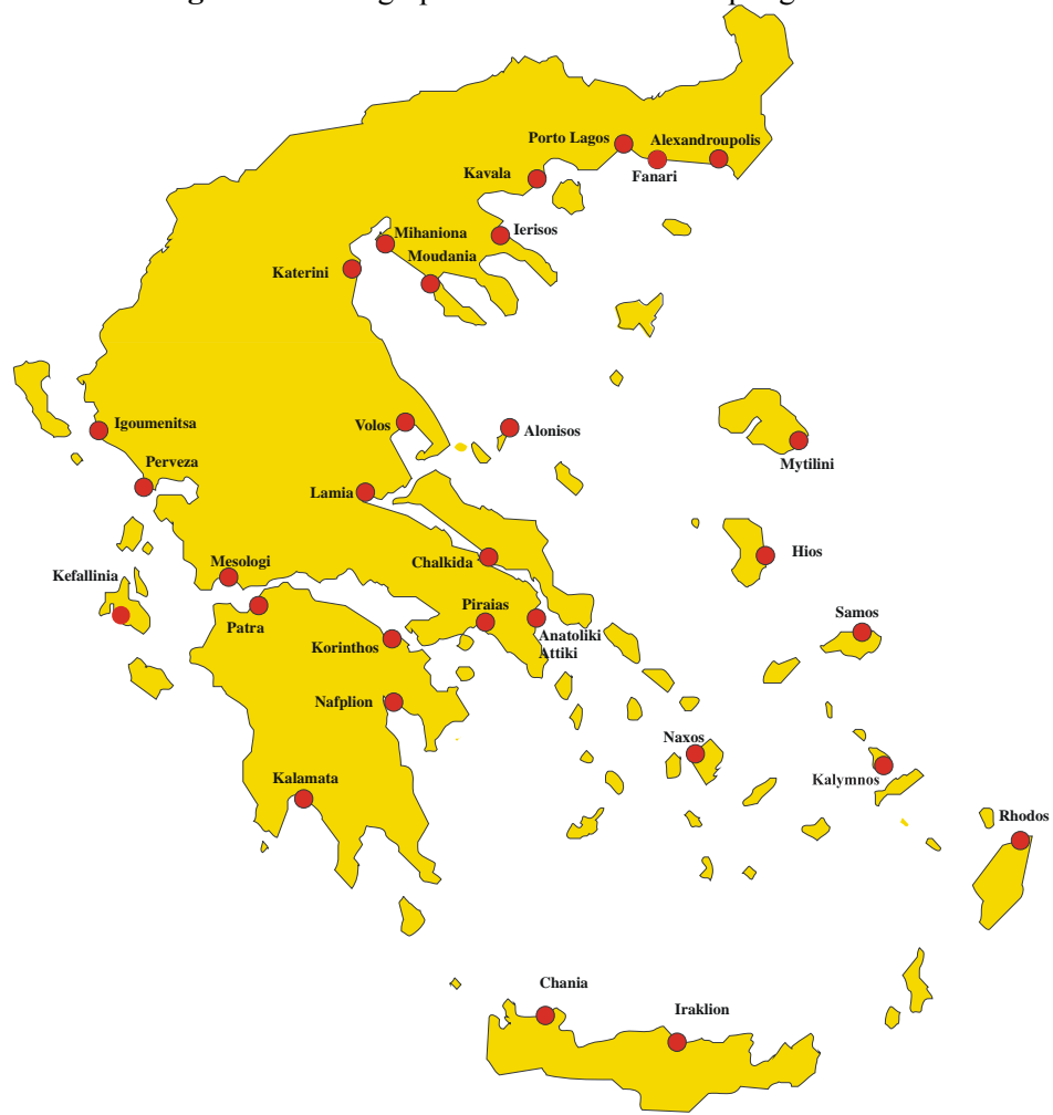
Table 7.1.: Distribution of sampling stations per control group