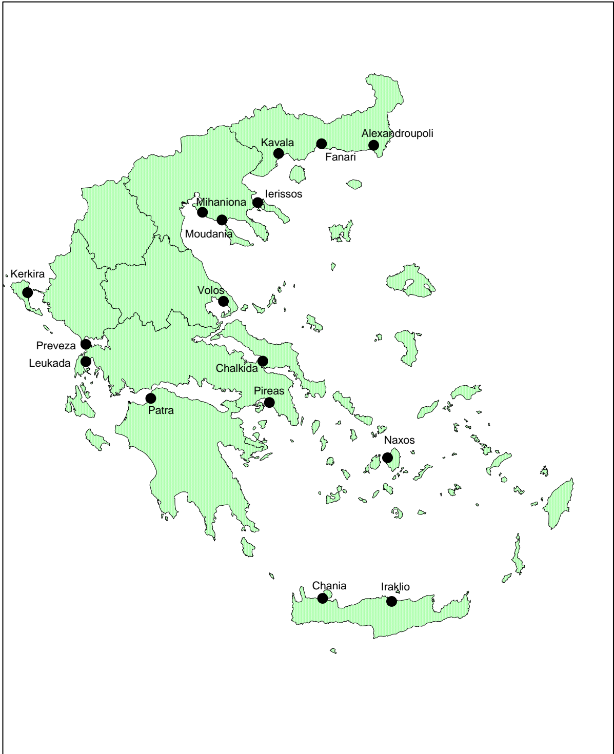
Figure 6.1. Map of selected landing sites for biological sampling