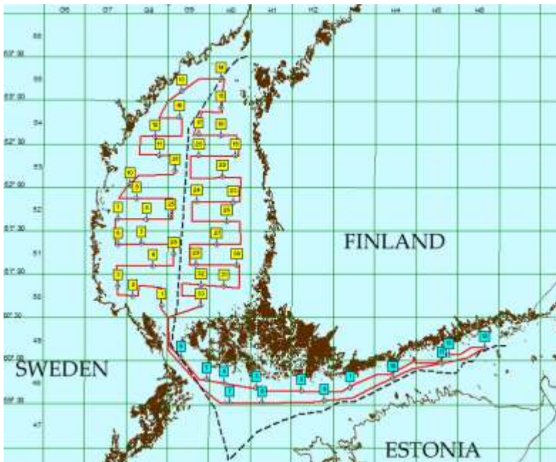
Map 2. Finnish survey track-trawl stations