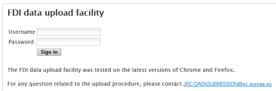
Figure 1: Sign in page

To access the upload tool, please insert the account name and the password in the corresponding fields, and then press the Sign in button (see Figure 1).